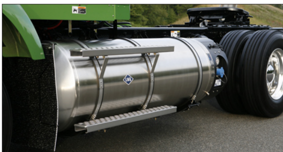
BOTTOM RIGHT - The Westport ISX-G offers the power of a diesel engine with reduced emissions and fuel costs.