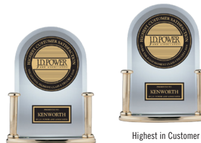
Highest in Customer Satisfaction among Vocational Segment Class 8 Trucks