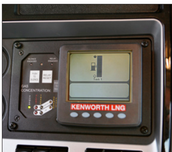
TOP LEFT - A large dash mounted display allows the driver to monitor the LNG level and other vital fuel system functions.